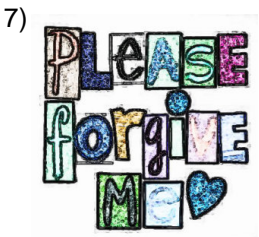
forgive me, excuse me