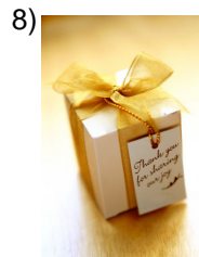
thank you very much