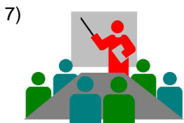
meeting, get together