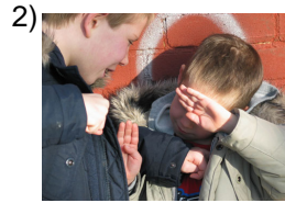
to bother, to bug