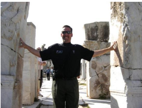
between, divided by