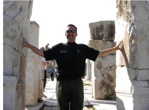
between, divided by