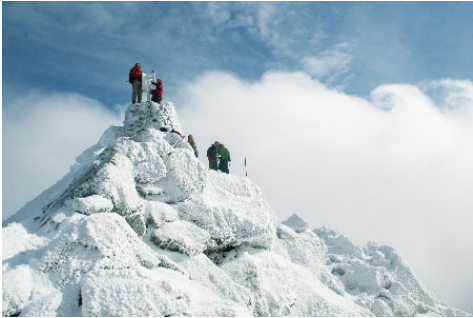
on top of