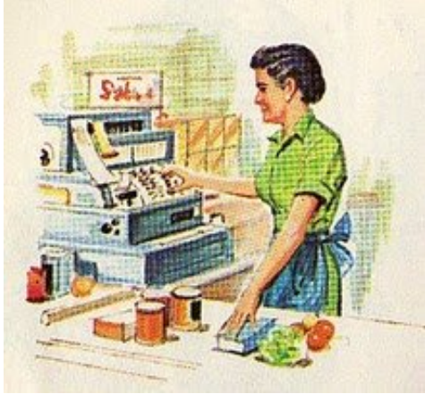
teller or cashier