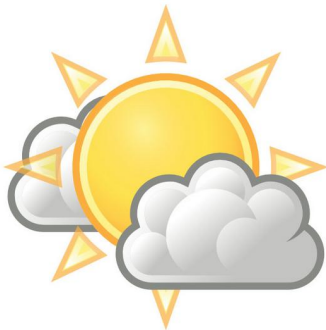
to be cloudy