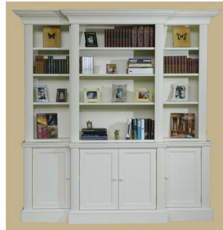
bookcase or shelves