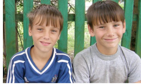
brothers or siblings