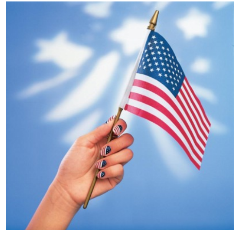
Fourth of July