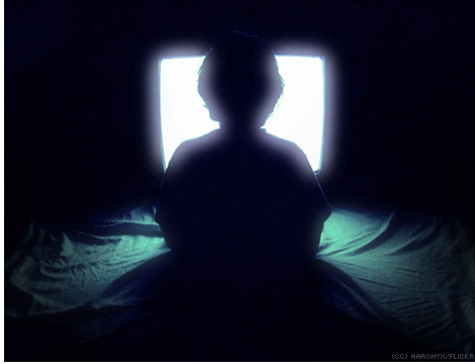
watch, to look