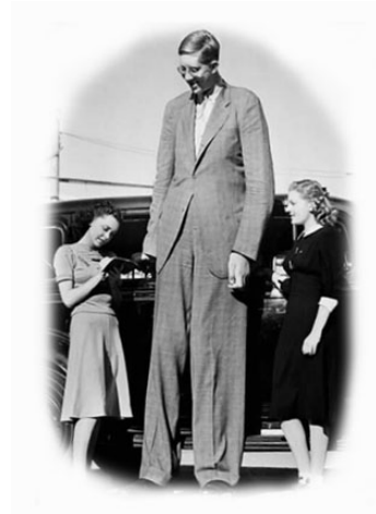
tall (masculine singular)