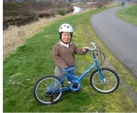
a short person